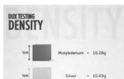
< 密度试验 >

所有DUX检测结果数据都会上传至Silver Bullion商品公差数据库，该数据库主要用来记录和评估测试数据。检测结果可以在线读取也可以链接到特定的金银条（包裹）上。对于那些非存储商品，在实施完检测之后，会在样本上贴上特制防篡改标签。