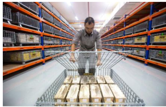
1,000 oz Silver Bars being Sealed in a Pallet Cage at The Safe House

The Safe House (TSH) 是我们在新加坡的保险库和DUX检测设施。TSH为我们提供了巨大的存储空间，剔除了中间商，并消除了通过西方存储公司保管时其所处地区的监管约束。