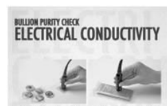
< ECM测试 >